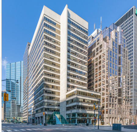
Toronto Office Location 55 University Avenue