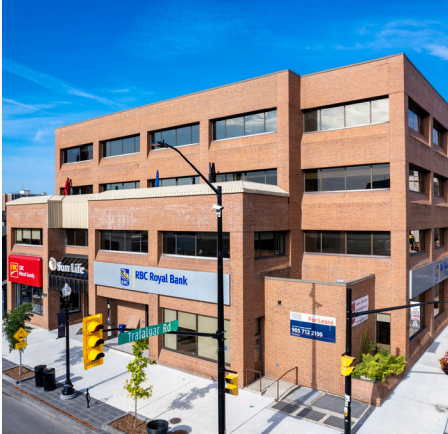
Oakville Office Location 277 Lakeshore Road E

Spend time at any of Wolf Law Chambers' co-working spaces!