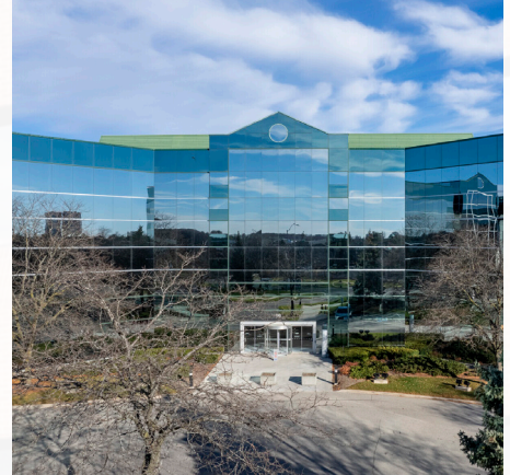
Mississauga Office Location 90 Matheson Blvd. W