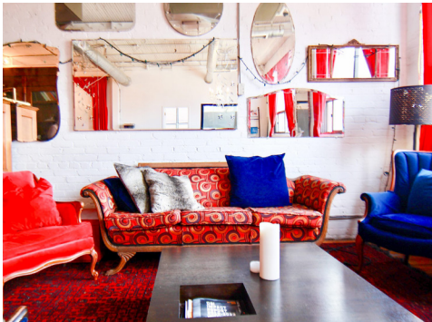
CCFE Solution Salon