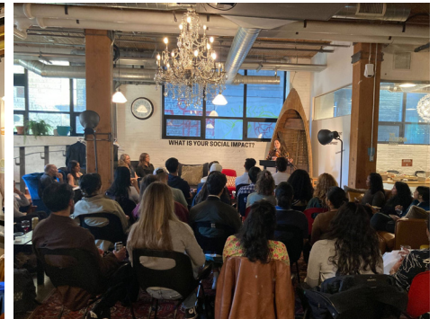
CSI Spadina Lounge