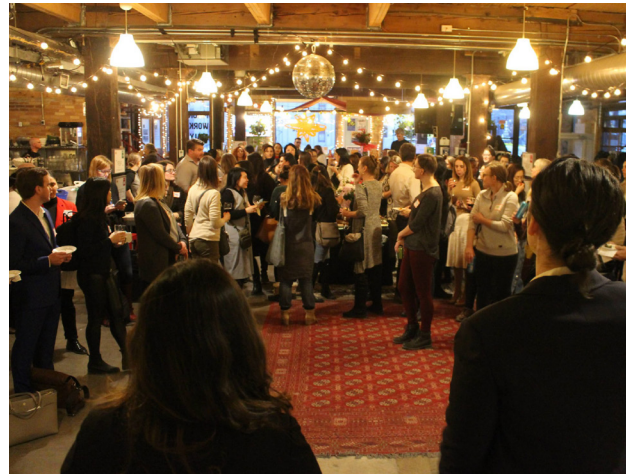
CSI Annex Lounge