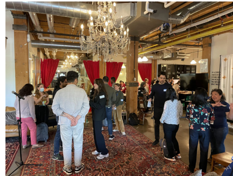
CSI Spadina Atrium