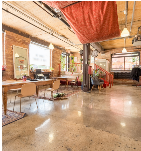
Ground Floor Lounge