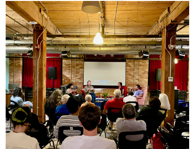
CSI Annex The Garage