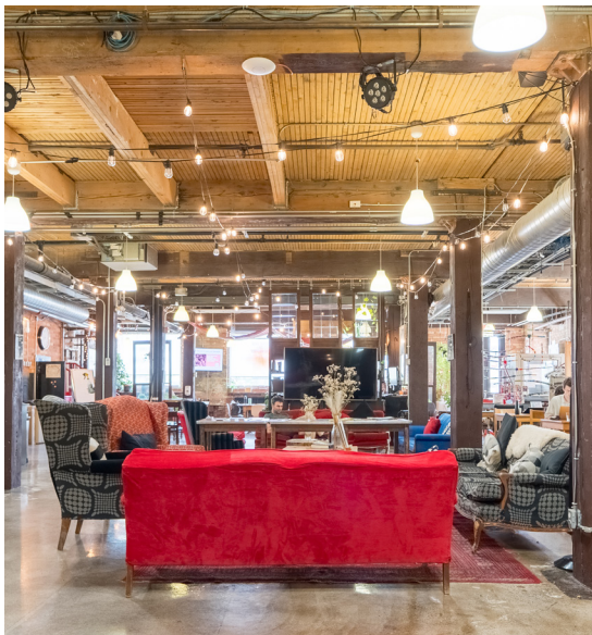
Ground Floor Lounge