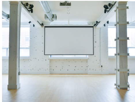
CSI Spadina Suite 101