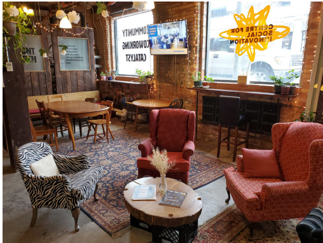
CSI Annex Front Porch