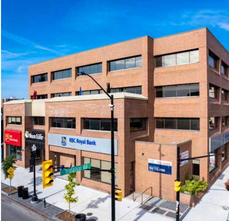
Oakville Office Location 277 Lakeshore Road E

Spend time at any of Wolf Law Chambers' co-working spaces!