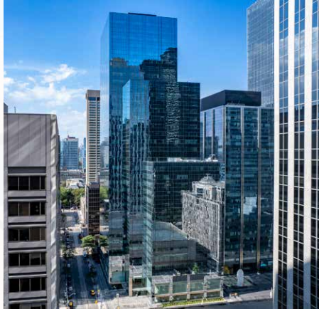
Toronto Office Location 130 Adelaide Street W