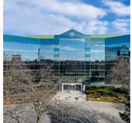
Mississauga Office Location 90 Matheson Blvd. W