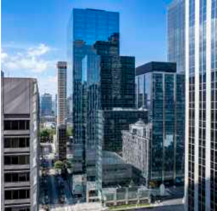
Toronto Office Location 130 Adelaide Street W

Spend time at any of Wolf Law Chambers' co-working spaces!