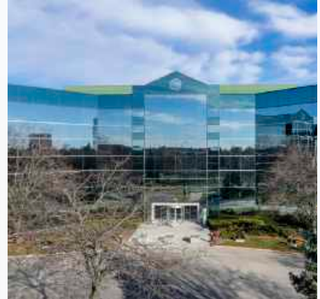
Mississauga Office Location 90 Matheson Blvd. W