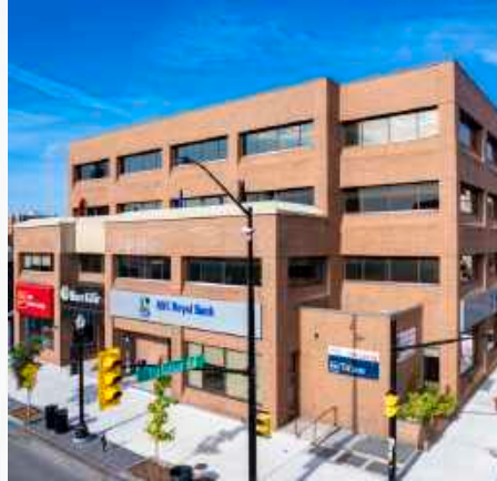
Oakville Office Location 277 Lakeshore Road E